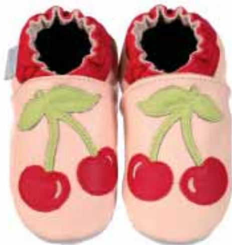
Robeez "Blush Cherries"

We are very excited to introduce Isabooties soft-soled baby shoes to the Twin Cities. Like Robeez (which are just as cute and wonderful as ever!), Isabooties are soft and supple and are held in place by a gentle elastic around the ankle that even a determined toddler can't wiggle out of.