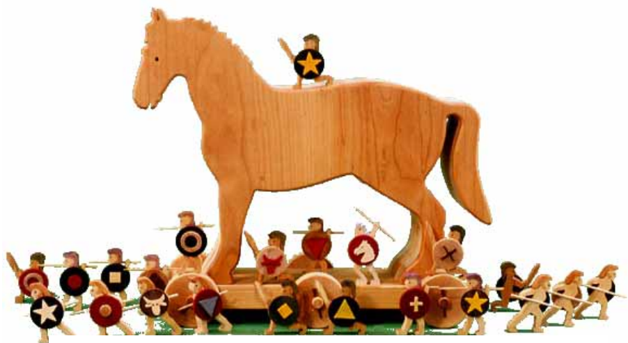
The Trojan Horse, by Wild Apples Toys. All of the soldiers fit inside