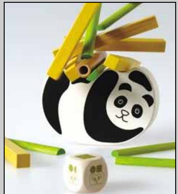
Be Happy! Pandabo Game from HaPe Toys

Pictured is the Pandabo game ($10), where players take turns stacking bamboo pieces on top of a tippy panda. Our favorite is Rapido ($15), which is kind of like the old game Hungry Hippos, where players race to capture colored wooden balls using bamboo tubes. Both are great for ages 4+. Ask for a demo!