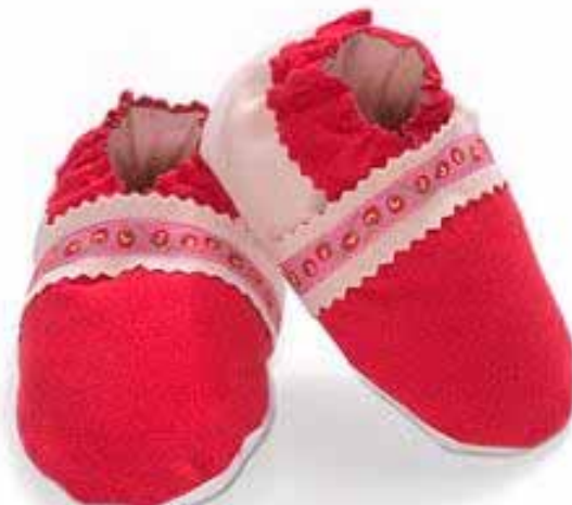
Isabooties "Sweet Cherry"

Instead of using a soft leather, however, Isabooties are made with Ultrasuede uppers and Toughtek soles. Toughtek is a super-strong high-grip synthetic fabric designed to protect the feet of search and rescue dogs. So, not only are Isabooties a vegan alternative, but they also a lighter-weight and perform better when damp. They come in 5 different patterns (not nearly as many choices as Robeez ) and are $24.