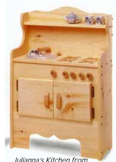
Julianna's Kitchen from