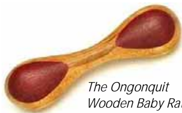
The Ongonquit Wooden Baby Rattle

On our recent family trip to New England, we took the opportunity to visit a couple of the toymakers who supply our store. Of course, many of our toys are factory made in the US, Europe, or Asia, but a few very special toys are made by hand in small workshops.