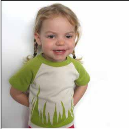
Green Grass Organic Tee from Speesees. If we'd have splurged on color printing for our newsletter, this would look really cool!

Just a couple of years ago, organic baby clothes meant kinda pricey but sorta cute outfits in various shades of oatmeal. We had some oatmeal and pink or blue combos, but that was about it.