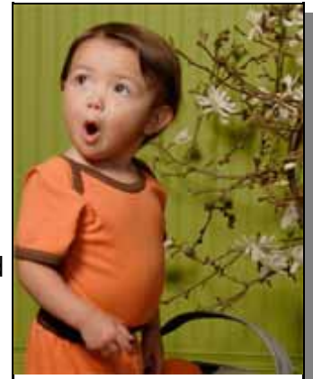
Tangerine Organic Bodysuit from Kate Quinn

Now, our baby clothes section is alive with color! Outfits from Speesees offer green grass tees and jumpers and a pomegranate red dress with a silkscreened dandelion burst. Kate Quinn Organics has onesies and rompers and dresses in plum, chocolate, and tangerine.