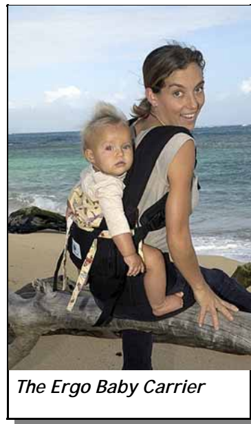
The Ergo Baby Carrier

After a child learns to walk, you've got 2 1/2 years where she doesn't always want to walk. You'll find yourself at the far end of a parking lot when suddenly...she...can't... seem...to..take....another...step.