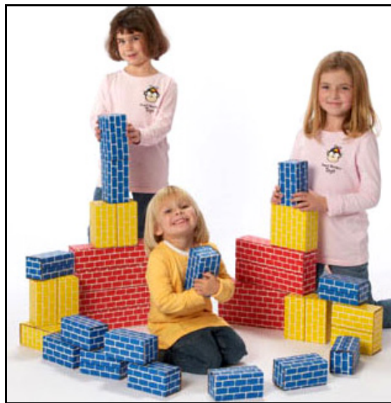
Made in Wisconsin from 50 % recycled paper, our cardboard blocks from Smart Monkey Toys are green, sturdy, and fun.

3. Materials. Obviously, organic cotton, wood and bamboo are greener materials than plastics. But wood from a well-managed forest or recycled rubberwood is greener than clearcut softwood. Even bamboo, which has been promoted for its low-impact qualities, can be problematic when new plantations replace woodlands. Toys made from recycled materials also score high here, especially since it helps kids appreciate a closed loop (so that's where the milk jug goes!).