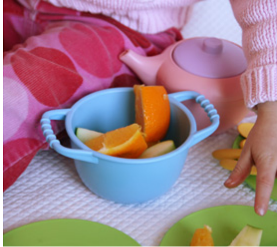
The aptly-named Green Toys is a new company that makes toys in the USA from recycled milk jugs. Truly innovators, they've also been experimenting with bioplastic, but haven't figured that out yet. We carry their tea set, cooking set, and sand toys.